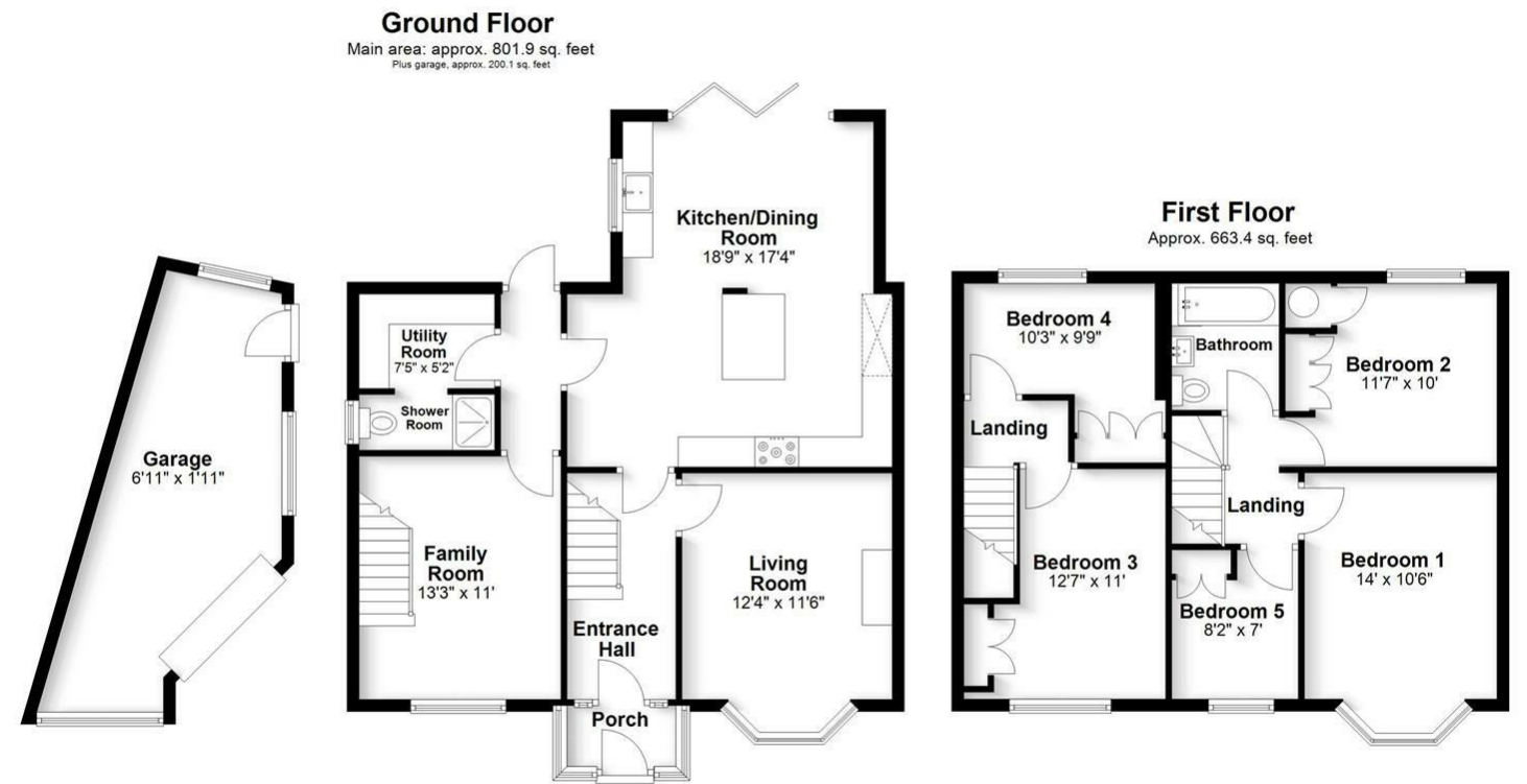
Ground Floor Main area: approx. 801.9 sq. feet Plus garage, approx. 200.1 sq. feet